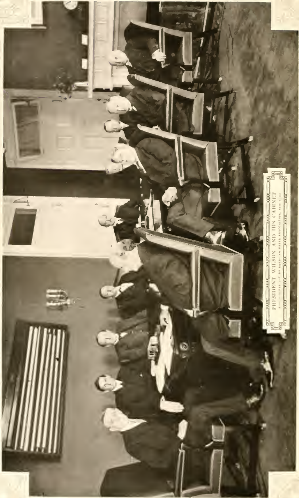
PRESIDENT WILSON AND HIS CABINET